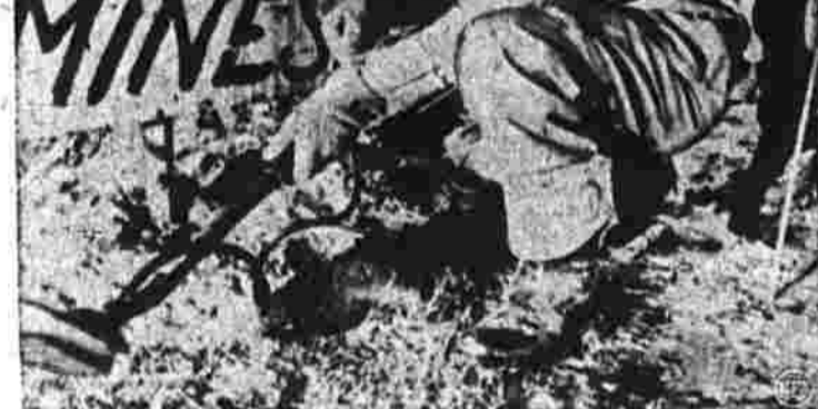
The warning on the sign in photo above is short—and emphatic, if not sweet. Near it, British soldiers are at the dangerous task of locating and digging up mines at Gellendörfen, Germany.

Low with M... The warning on the sign in photo above is short—and emphatic, if not sweet. Near it, British soldiers are at the dangerous task of locating and digging up mines at Gellendörfen, Germany.